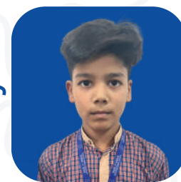
Aatif II A